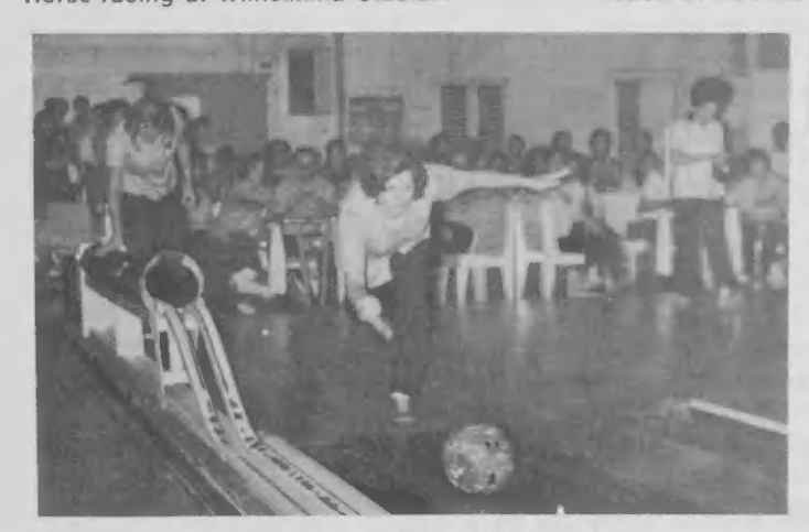
International Bowling at Esso Club